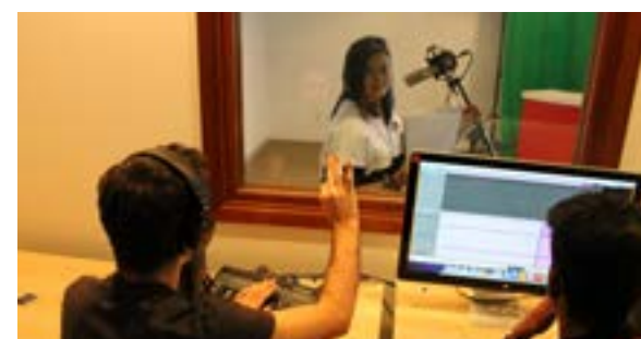
Recording and Editing Studio