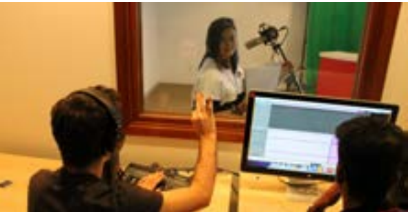
Recording and Editing Studio