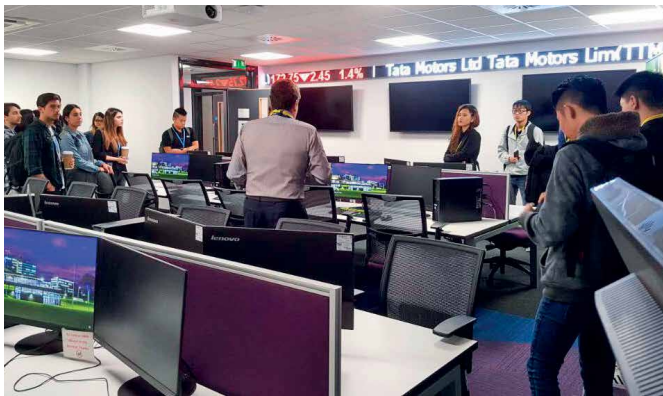
A first-hand look at the workings of the Bloomberg Financial Market Lab which services financial institutions worldwide.