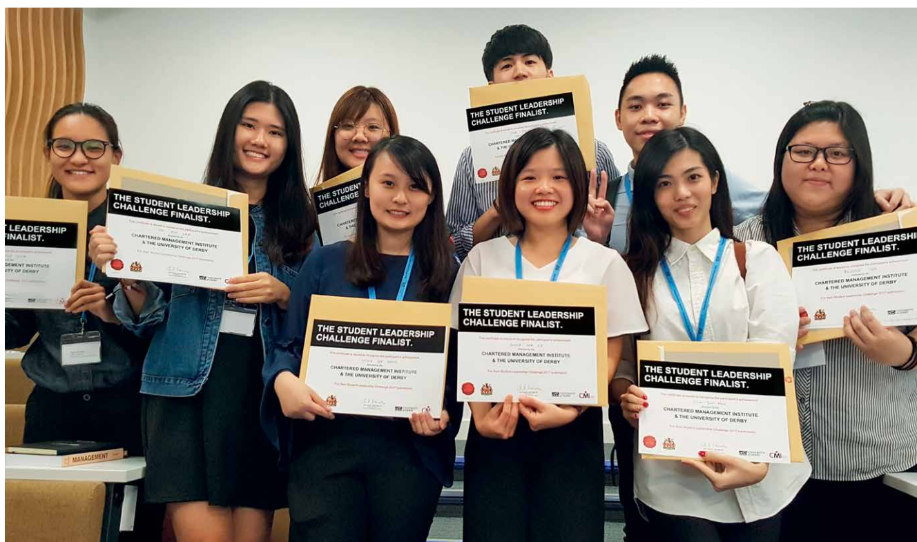
Finalists in the Chartered Management Institute-University of Derby Student Leadership Challenge programme at the University's International Summer School.

At the commencement of each module, students will be provided the assessment mode and weightings for the module. Most modules have several points of assessment, which may include assignments, tests, projects and final examinations.