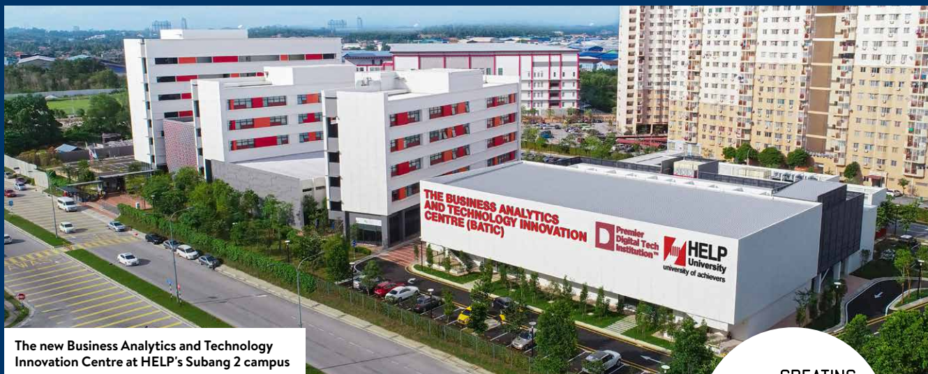
The new Business Analytics and Technology Innovation Centre at HELP's Subang 2 campus