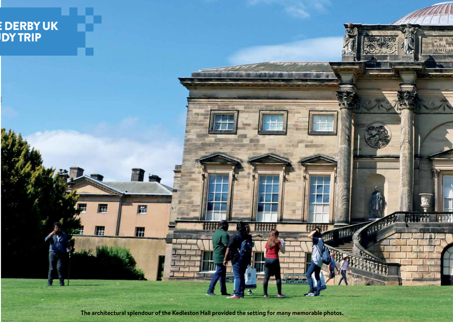
The architectural splendour of the Kedleston Hall provided the setting for many memorable photos.