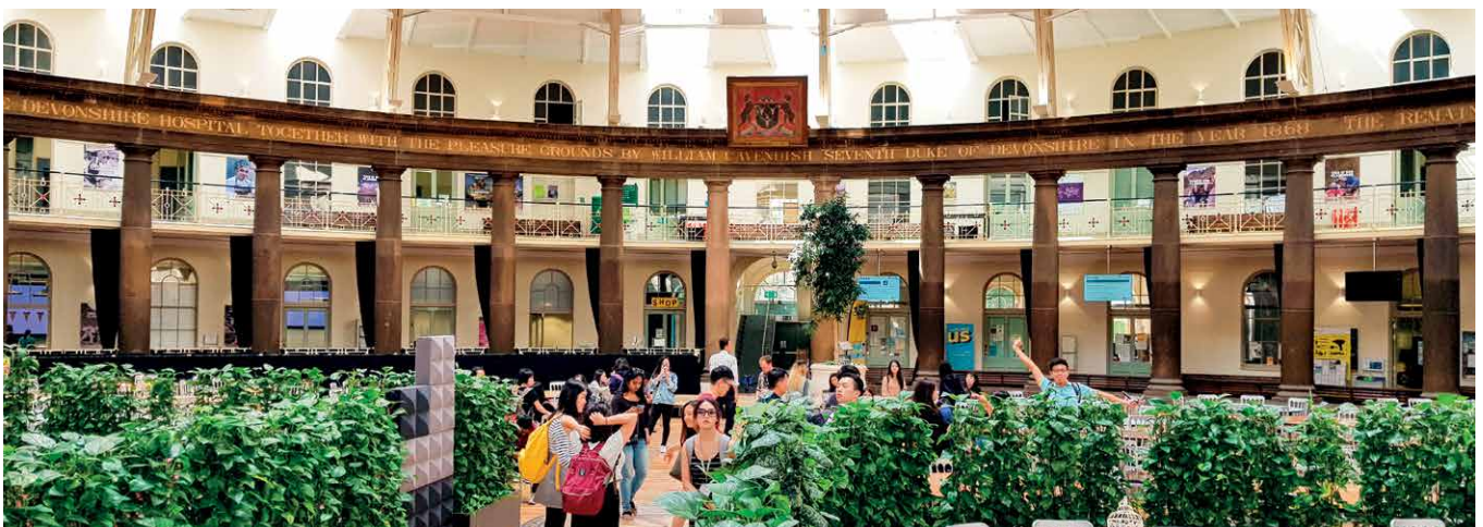
The Devonshire Dome in Buxton Campus - a stunning heritage project - now hosts the UK's premier banquets and events.