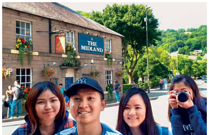
A photo after lunch at a quaint English pub (background) in Matlock Bath, Derby.