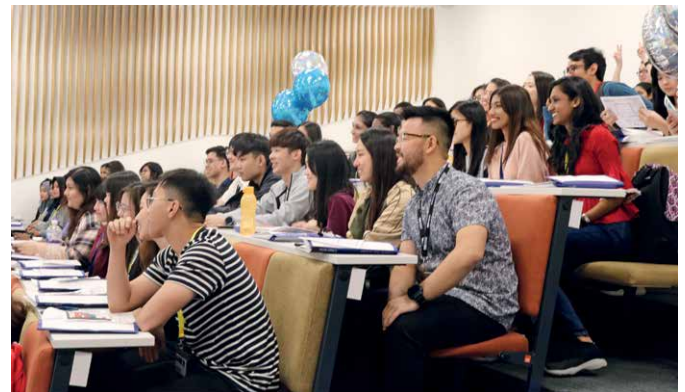
Student focusing on the welcoming brief by the University