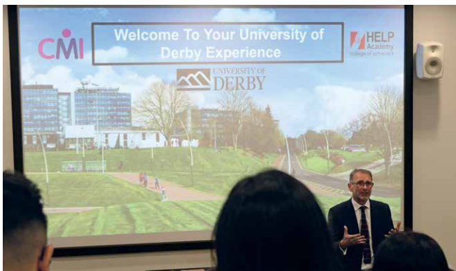
Welcoming brief by the CMI representative