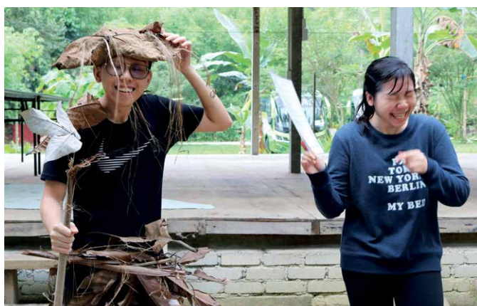
Marketing product using limited resources by DOMS's student.