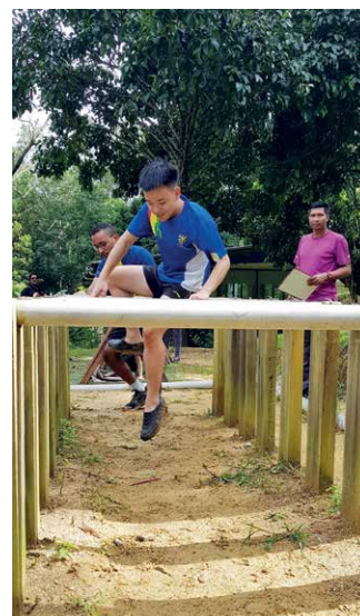
Obstacle challenges that push students to step up for themselves and face the challenge in front of them.